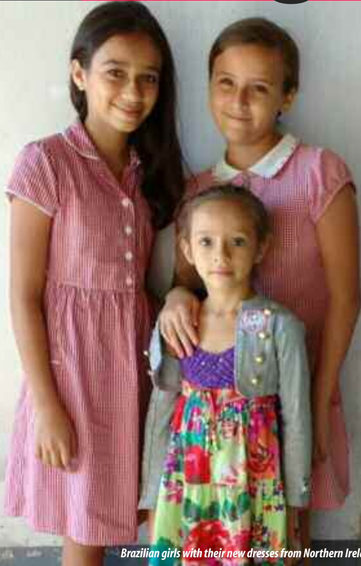
Brazilian girls with their new dresses from Northern Ireland in Rio Branco