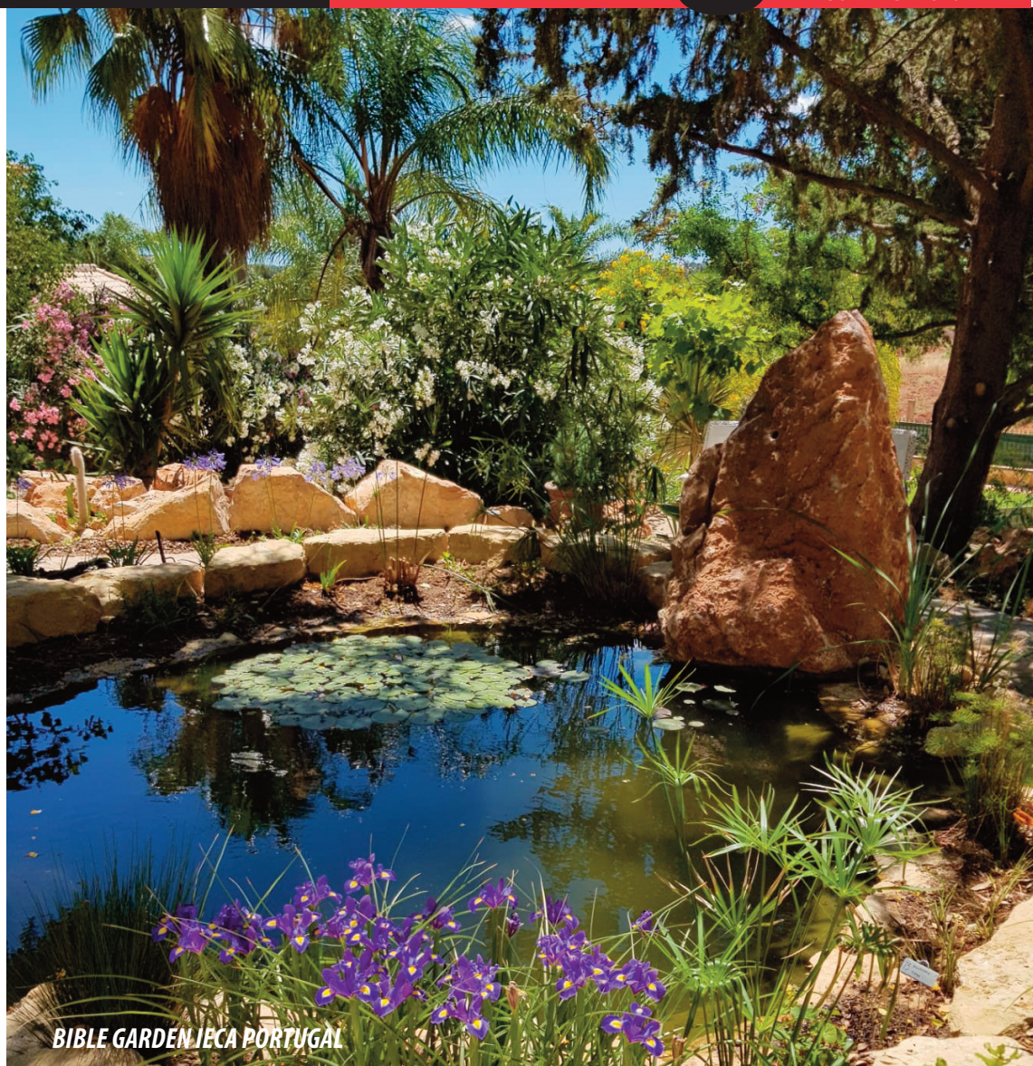
BIBLE GARDEN JECA PORTUGAL